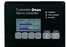
Cummins Onan Digital Display