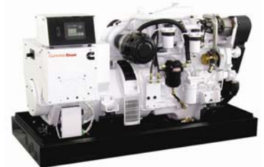
Standard model without sound shield