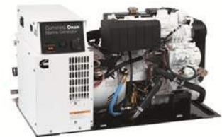
Standard model without sound shield shown