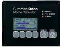
Cummins Onan Digital Display