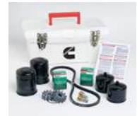
Cummins Onan Cruise Kit